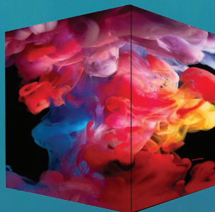
°90 Corner Install