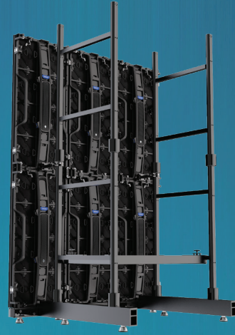
Stacking Installation Accessories (ground beam & support, back frame & connector)